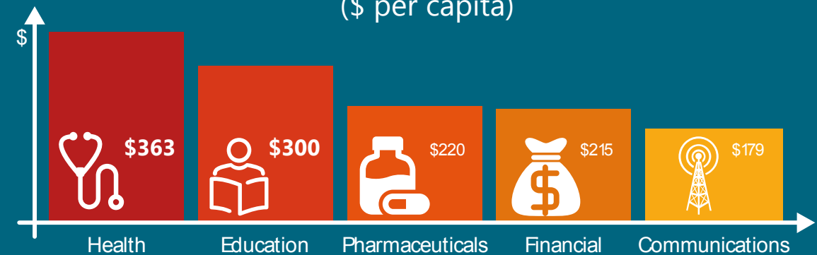
Cost of data breaches by industry ($ per capita)